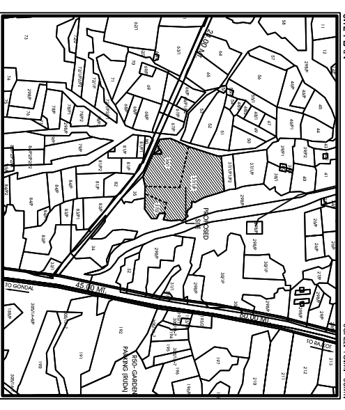
1.0 - AREA TABLE SUMMARY